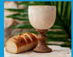
Restarted delivery of Communion to homebound members