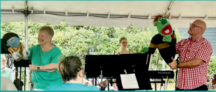
Worship on the Lawn with puppets