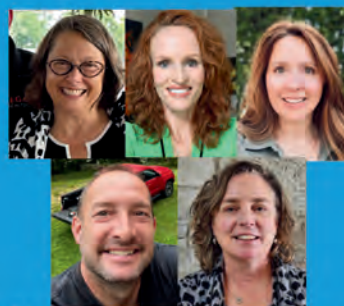
Middle School Leaders