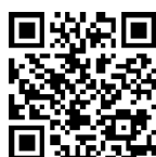
QRCode for Giving