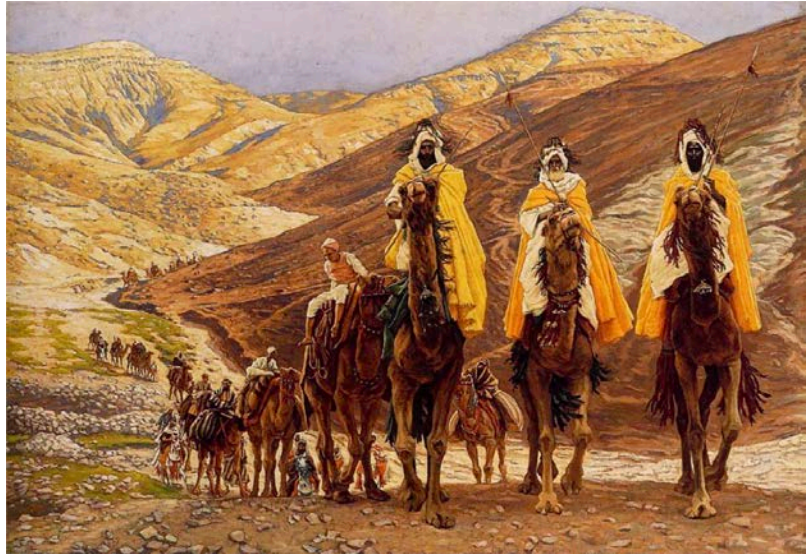
James Tissot, Nantes, France, 1836–1902, Brooklyn Museum