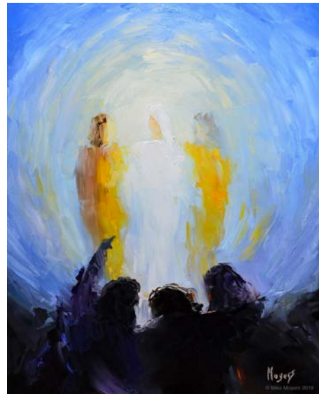
Transfiguration by Mike Moyers