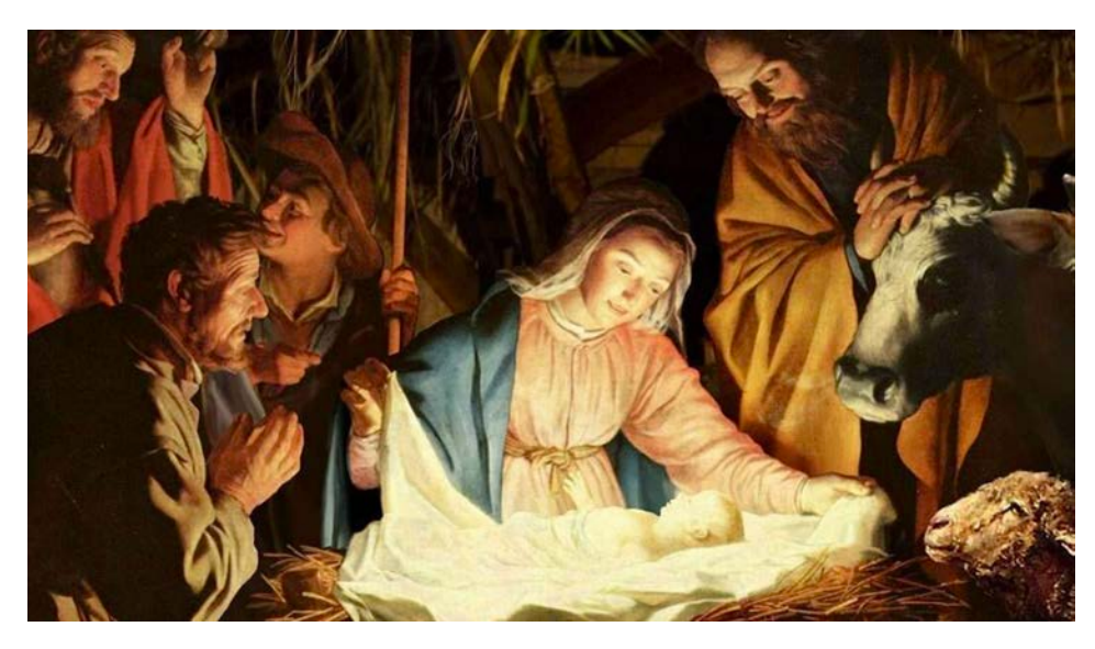
Gerard van Honthorst, The Adoration of the Shepherds, 1622