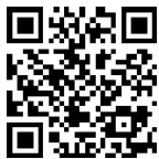
QRCode for Giving